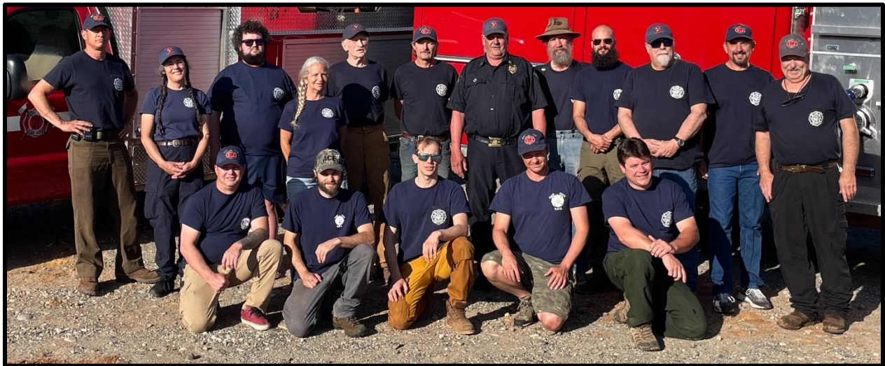
May 15, 2023. Pike City and Alleghany Fire Department First Responders

https://www.firesafesierracounty.org/hazardous-fuel-reduction